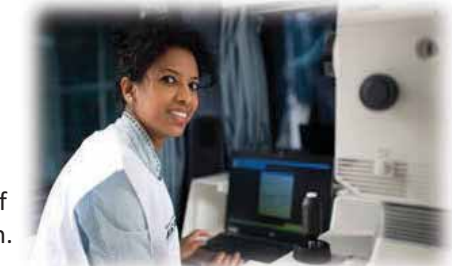
ABOVE: Retinal photographs can be taken on the road thanks to the RetCam Vans.

Participants who entered ASPREE prior to the commencement of the AMD sub-study and therefore missed out on the opportunity to have a baseline image taken, may still be able to take part. We are seeking permission from participants to access retrospective photographs taken by their eye-care providers. This permission is being sought at annual ASPREE visits, Biobank visits or by mail outs. A second set of retinal photographs will be taken around the third annual visit to compare changes in eye health.